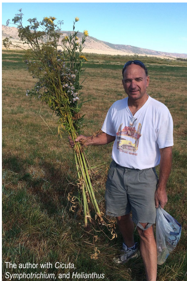
The author with Cicuta , Symphotrichum , and Helianthus