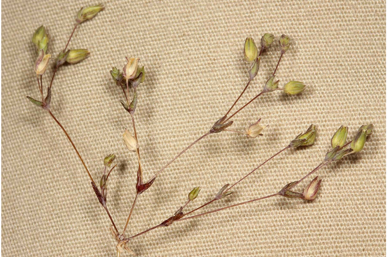
▲▲ Minuartia pusilla in fruit