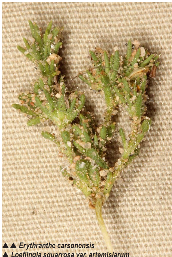
▲▲ Erythranthe carsonensis

pusilla , long known as Arenaria pusilla , has a characteristic pink family look with opposite leaves from swollen nodes and pointy sepals, similar to its larger relative, the carnation. It can have petals that are shorter than the sepals and sometimes the petals are lacking. It is definitely not showy and the entire plant looks like the inflorescence of one of the perennial Minuartias like M. nuttallii .