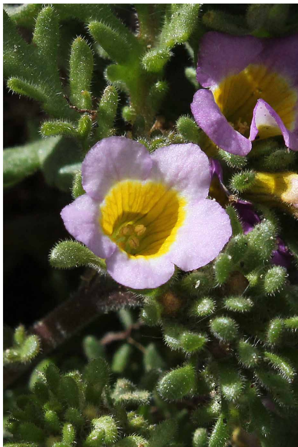
▲ Phacelia bicolor