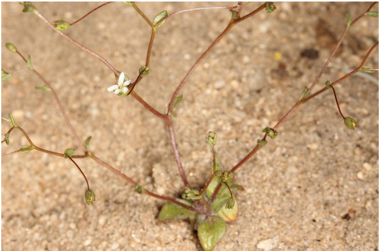
▲▲ Calyptridium roseum ▲ Nemacladus sigmoides

We then went south of Carson City and east on Sunridge Road. We stopped at a somewhat sandy spot that was home to a large population of Carson Valley monkeyflowers. A closer look revealed Pectocarya penicillata and Nemacladus sigmoides were present here, too, both of which were new county records for me as we had made it to Douglas County. Further inspection revealed two more petite jewels - Minuartia pusilla and Loeflingia squarrosa var. artemisiarum - both members of the pink family, Caryophyllaceae . Minuartia