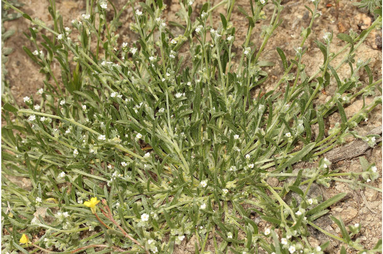
▲ Pectocarya penicillata and ▼ with nutlets