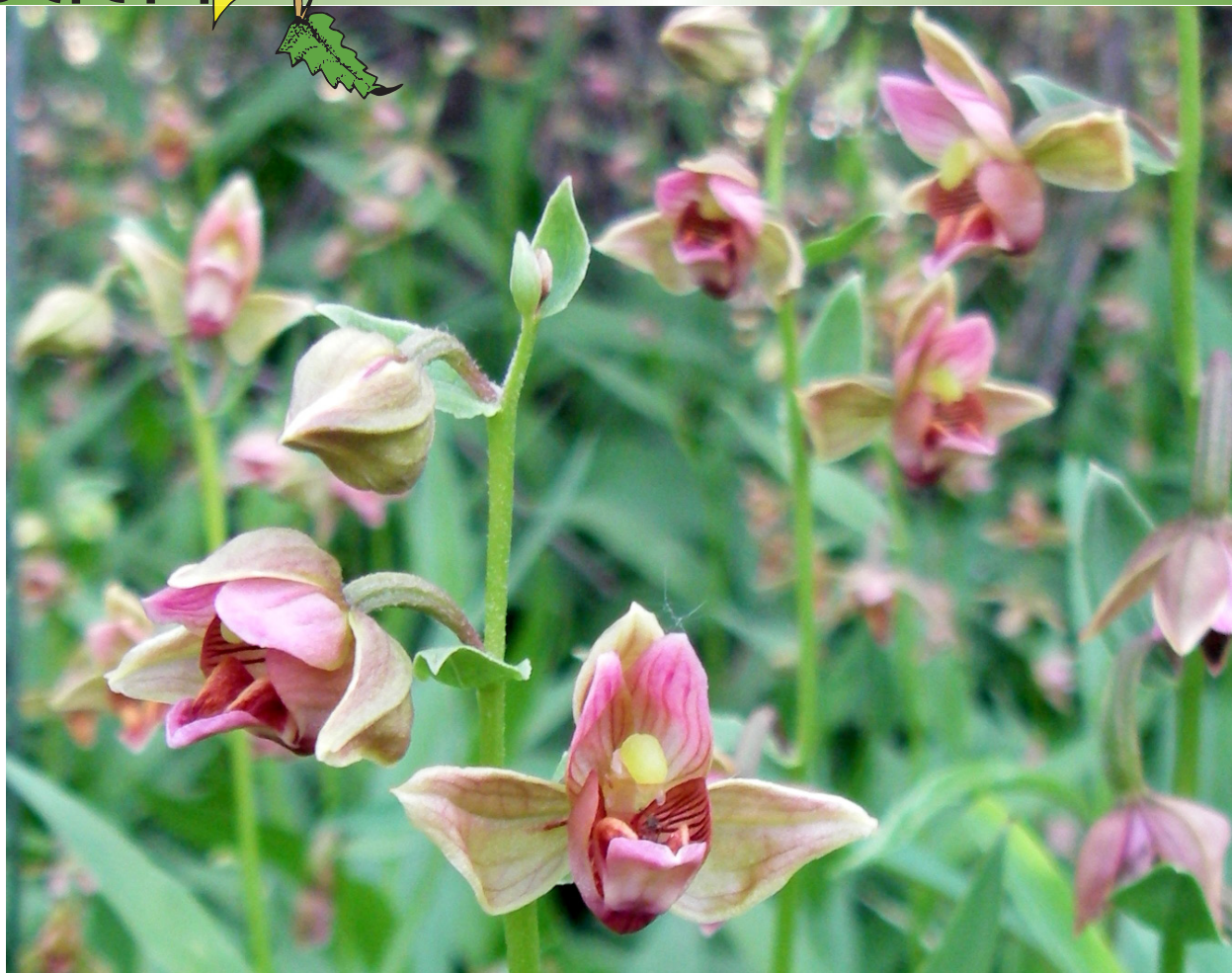
Epipactis gigantea (stream orchid)